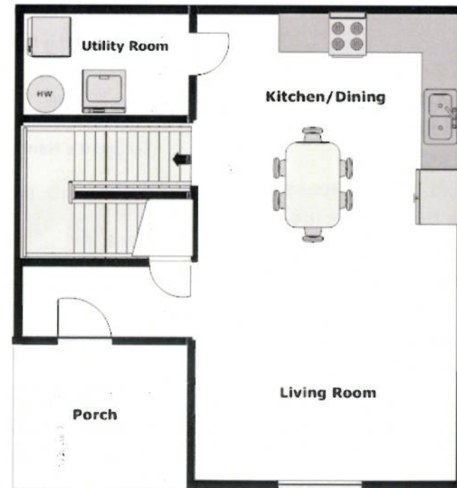
Ground Floor Plan 563 sq.ft.